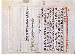
The Ministry of Education's letter to Tohoku University

In the 110 years since their acceptance, Tohoku University's unwavering 'Open Doors' policy has welcomed talented students, regardless of gender, ethnicity, nationality, or economic background.